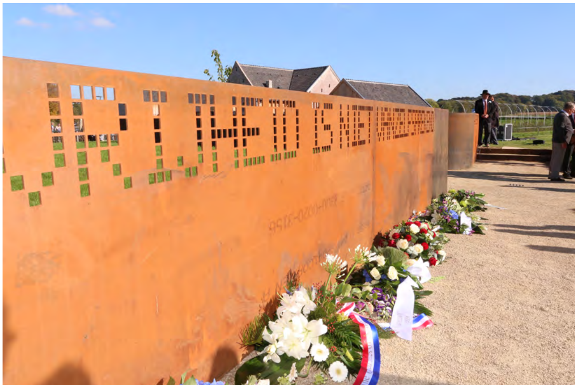
Left fuselage and wing outlined by a metal wall, inscription reads: "vrijheid is niet vanzelfsprekend" (we cannot take freedom for granted)