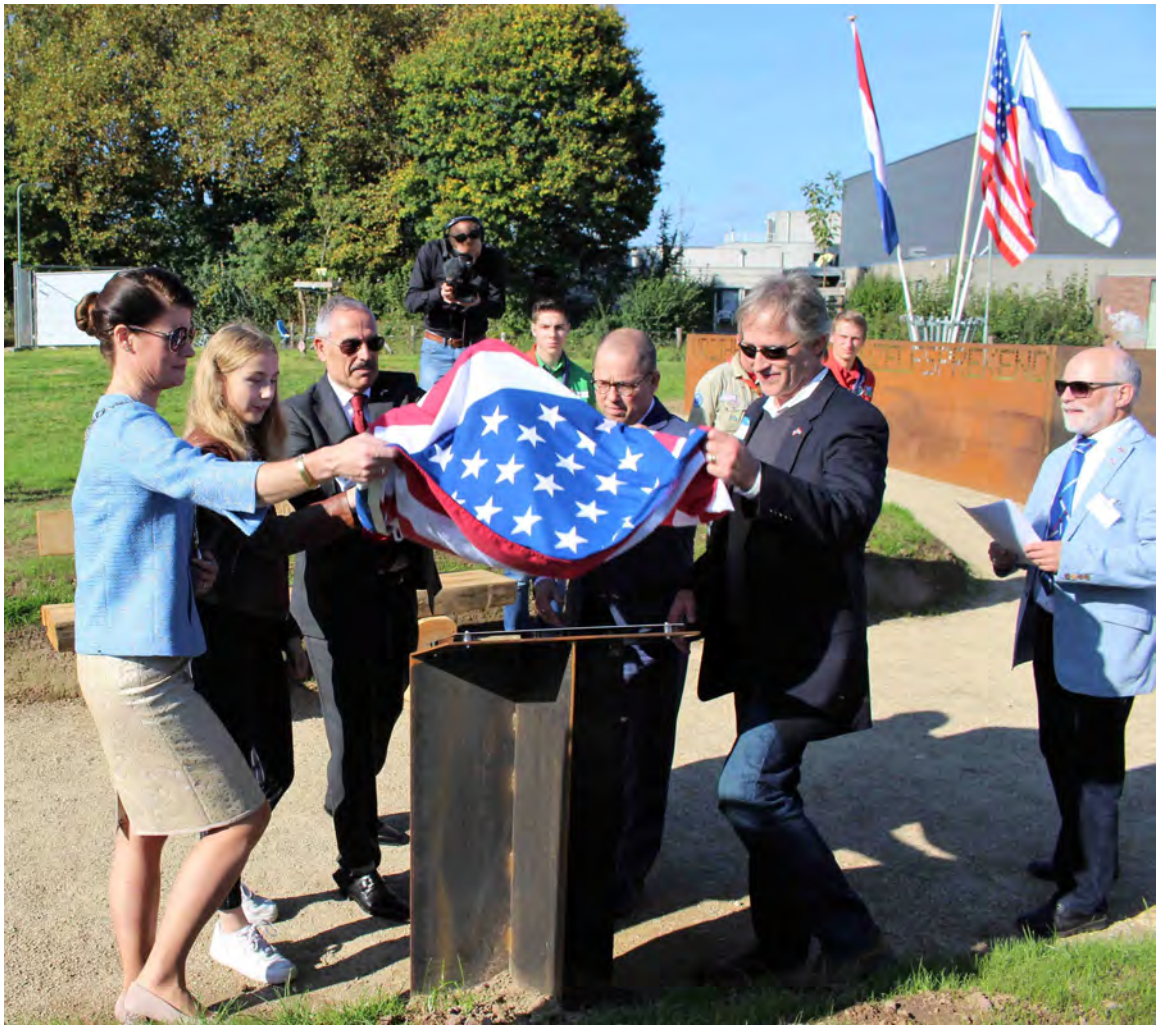
Unveiling the memorial plaque