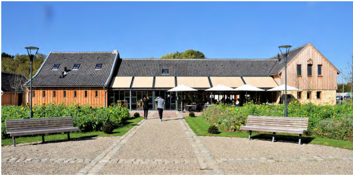
Beek, Netherlands Visitor's Center