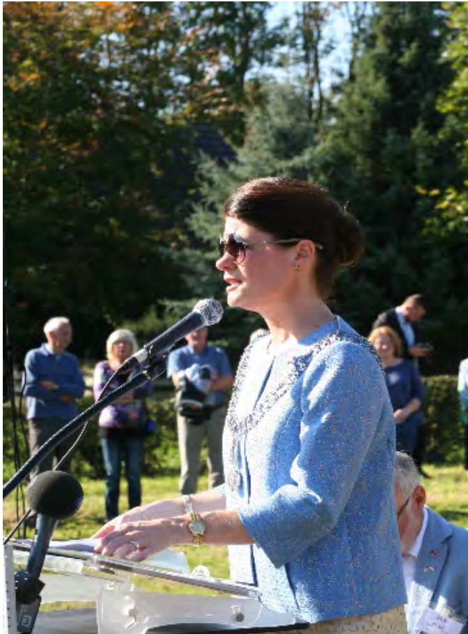
Mayor of Beek