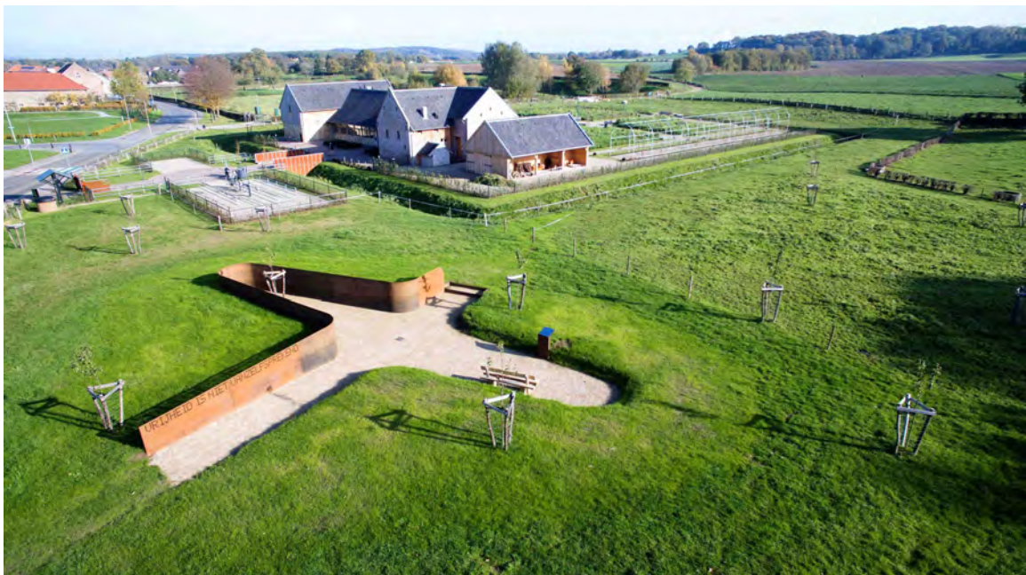
Aerial view of Memorial to 42-29971, low metal wall outlines the left fuselage and wing (Beek Visitor's Center in background)