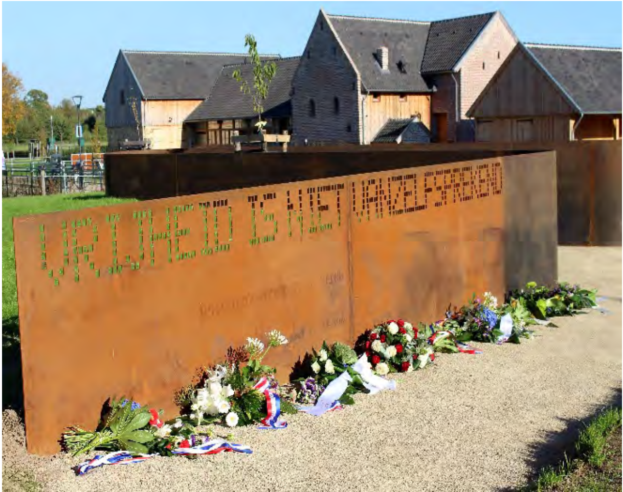
"We cannot take freedom for granted" (holes spelling out the words of the inscription represent bullet holes)