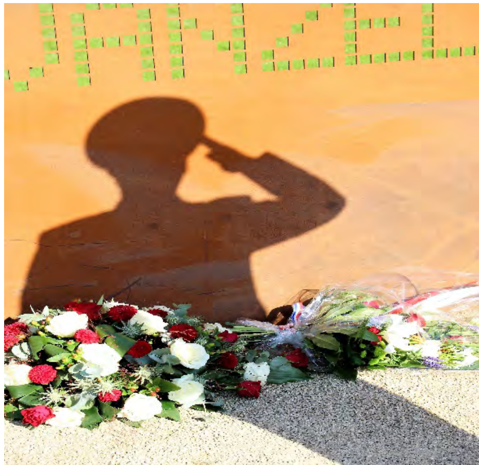
A final salute