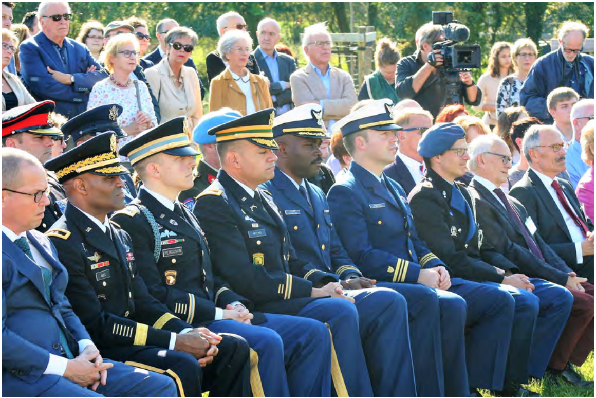
NATO officers and dignitaries in attendance