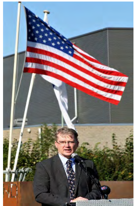
U.S. Charge d' Affaires