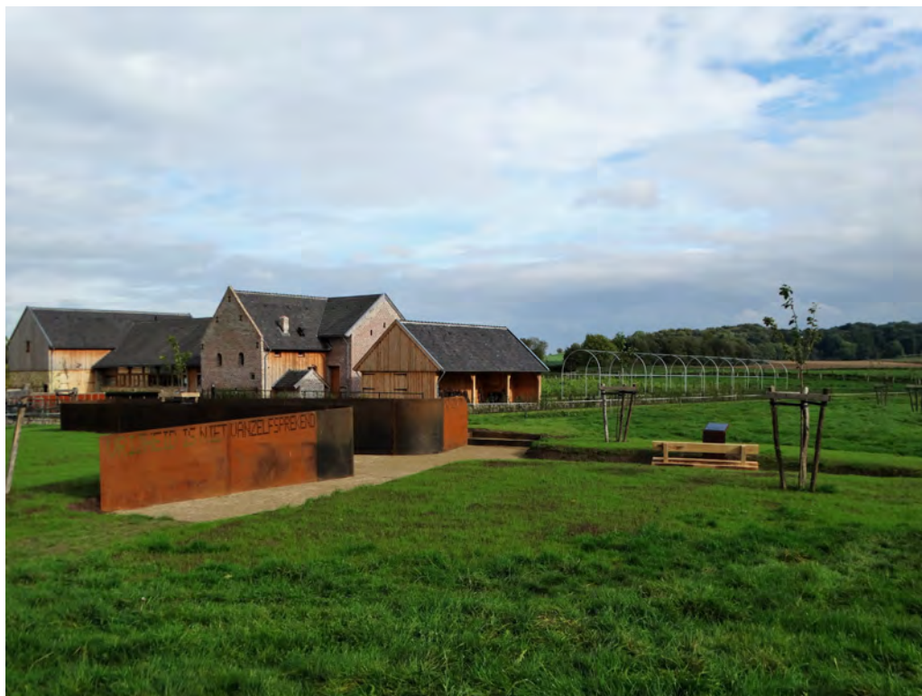
42-29971 Memorial (Beek Welcome Center in background)