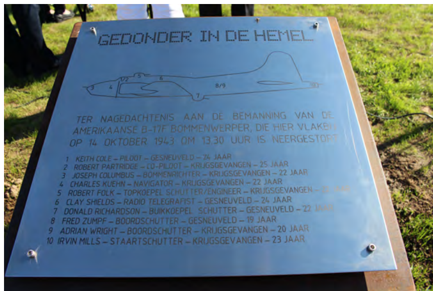
The plaque with crew listed, "Gedonder In De Hemel (Thunder in Heaven)"