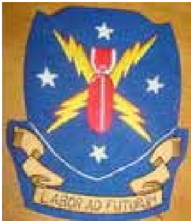
452 Bomb Group