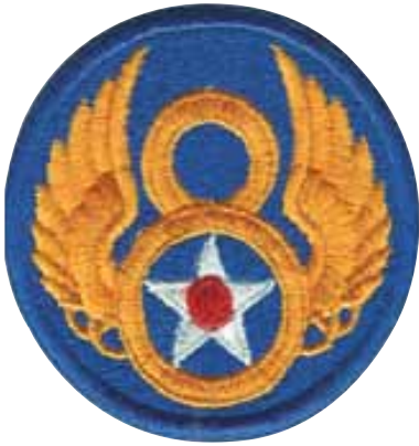
8th Air Force