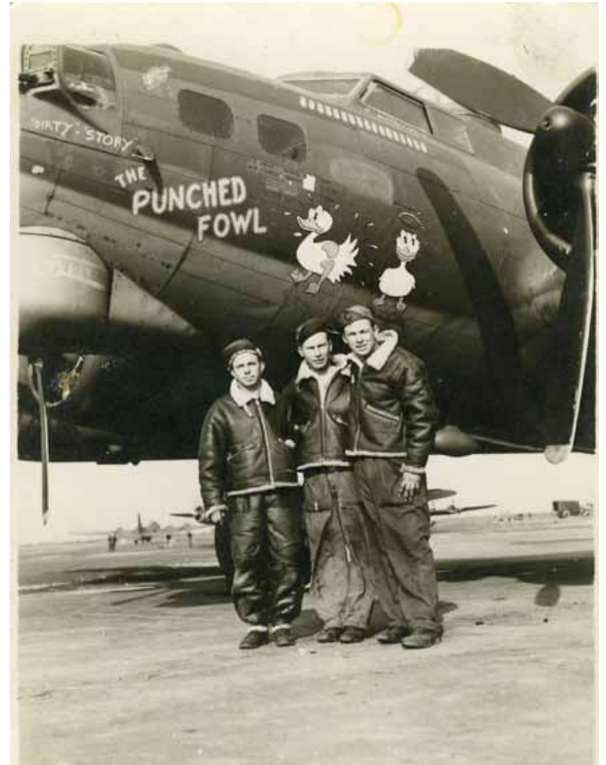
The Punched Fowl and unknown crew members