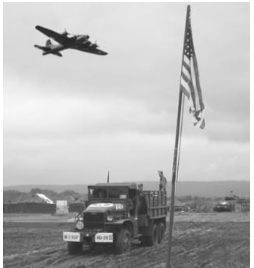
B-17 flying over Deopham Green Airfield