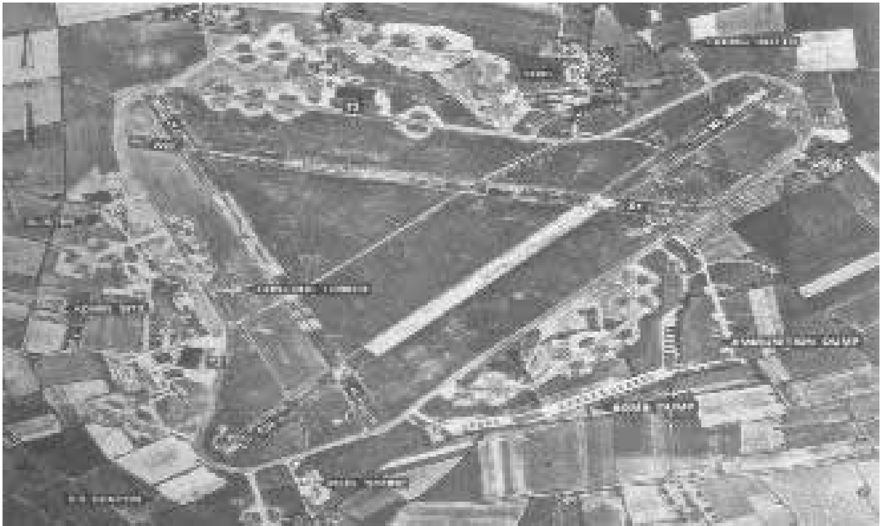
Deopham Green Air Field, 1946