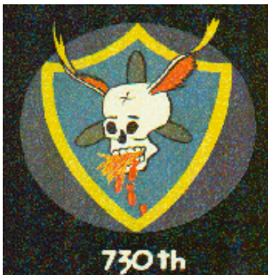
730th Bomb Squadron

Patches from the groups Derr was assigned to at Camp Rapid, Rapid City, South Dakota.