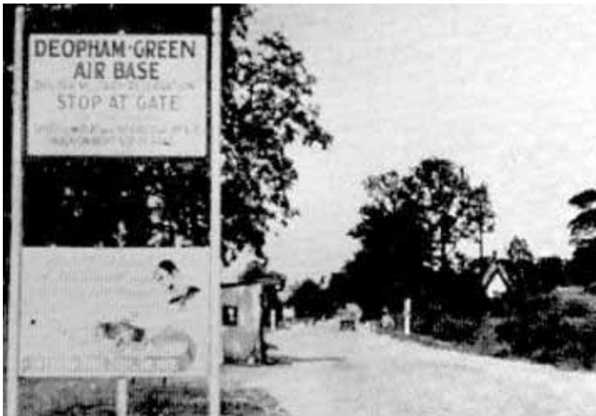
The main gate of the Deopham Green Air Base in England

During World War II, Wilbur Derr was stationed at Deopham Green airfield in England. He, with the 452nd Bomb Group were assigned there in January of 1944.