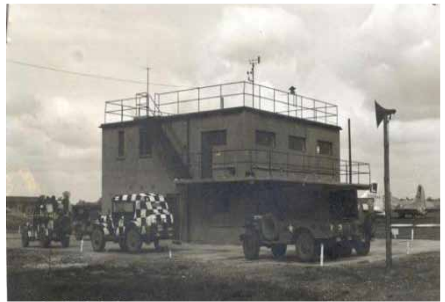
The control tower at Deopham Green Airfield

Deopham Green was built in 1943 for the USAAF. It served as a base for the US 8th Army Airforce's strategic bombing campaign in Europe. Deopham Green is located approximately 5.5 miles south west of Wymondham, between Hingham and Great Ellingham, England. Fully equipped with B-17 Fortresses, the airfield was constructed for heavy bomber use and was occupied by the 452nd Bomb Group. Combat operations began in February of 1944. In addition to strategic missions, the 452nd also flew missions in support of ground forces. This included aiding in the preparation for the invasion of Normandy by bombing airfields, V-weapon sites, bridges, and other objectives in France. The group flew a total of 250 missions from Deopham Green during the war and lost 110 bombers in this time. The base has since been reverted to agricultural use, however a memorial and dedication plaque remains.