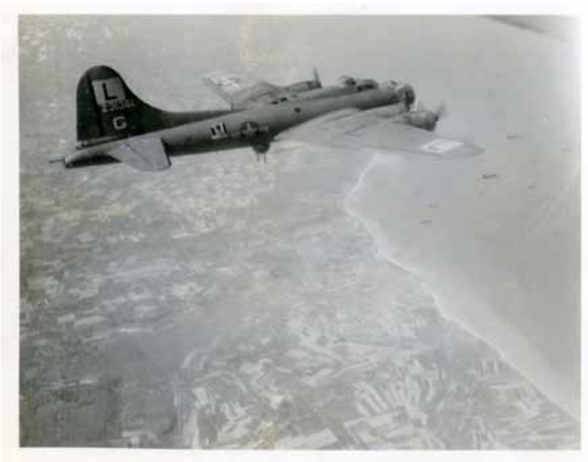
B-17 in flight