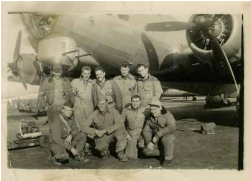
B-17 with its crew, unknown names