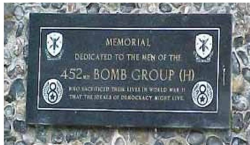
Plaque at Deopham Green dedicated to the 452nd Bomb Group